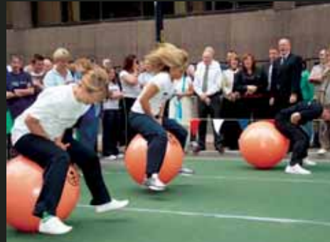
LCDP Sports Day