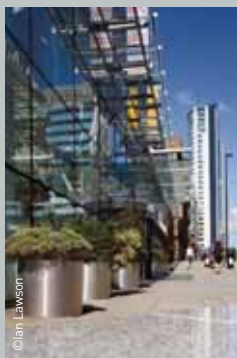
Old Hall Street