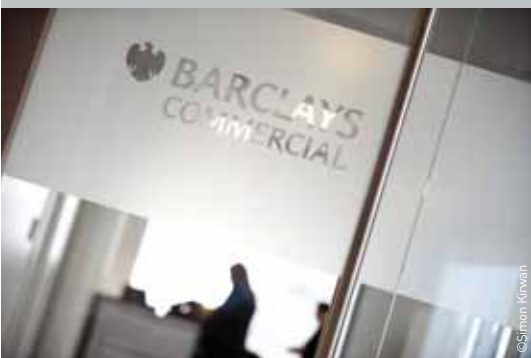
20 Chapel Street