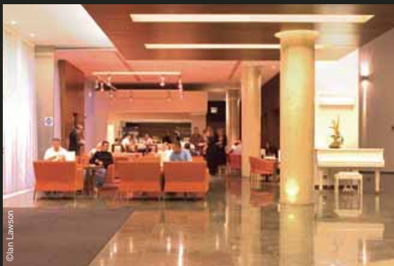
The White Bar

And we've been spoilt for choice in terms of public art, from the incredibly popular Superlambananas to Web of Light - a giant spider in a net above Exchange Flags.