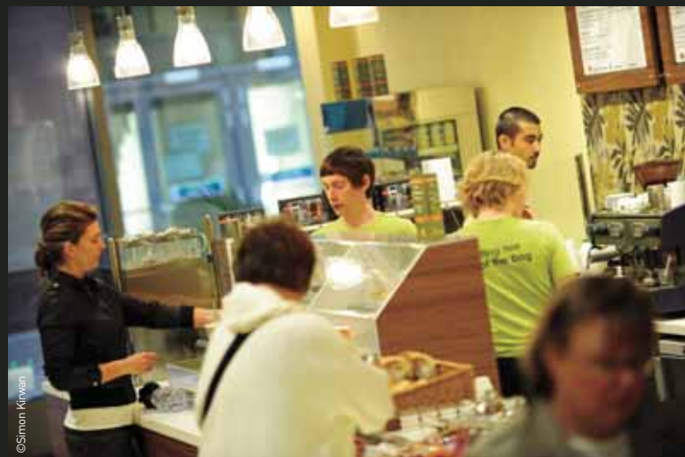
Brew Tea Bar